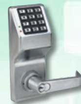
With IC Core in 26D DL2700IC/26D