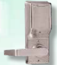
Secure battery compartment on inside door