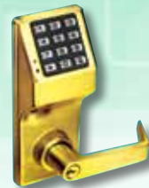
Lever set in US3 DL2700/3